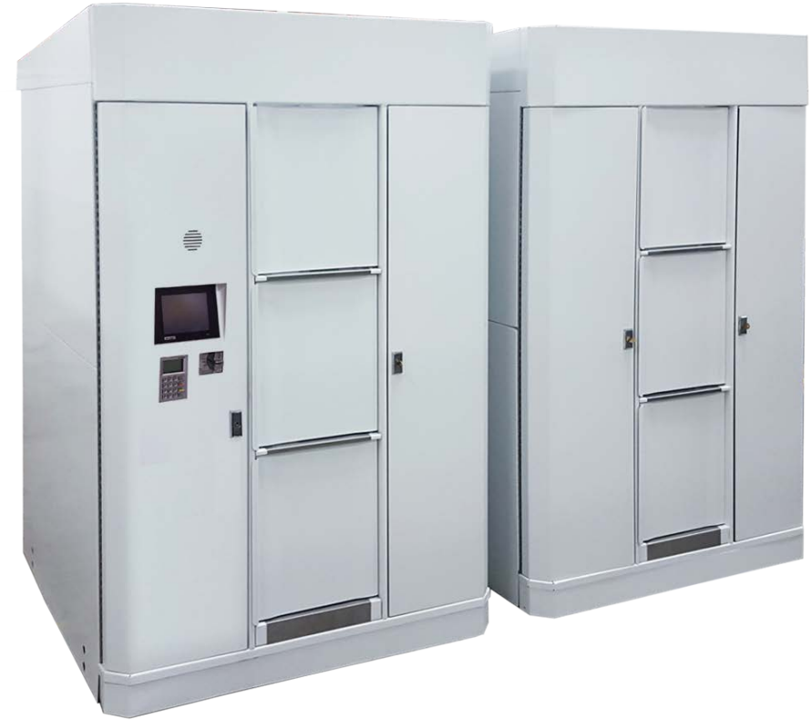
1-Host 1-Servant Configuration

4 kiosks can store 94 cylinders requiring only 18 linear feet of wall space and one standard 15 amp, 120 VAC electrical outlet